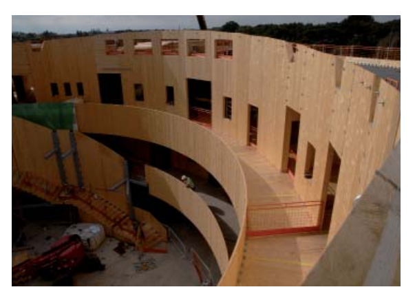
Figure 6: CLT forms solid loadbearing planes, just like masonry walls and concrete slabs, with offsite precut windows and doors

Some suppliers offer CLT that has been given European Technical Approval (ETA), ie approval based on testing carried out to agreed European levels; the British Board of Agrément (BBA) is the designated lead issuer of such approvals in the UK. ETA is more relevant to new or innovative construction products for which Harmonised European Standards (hENs) have yet to be developed.