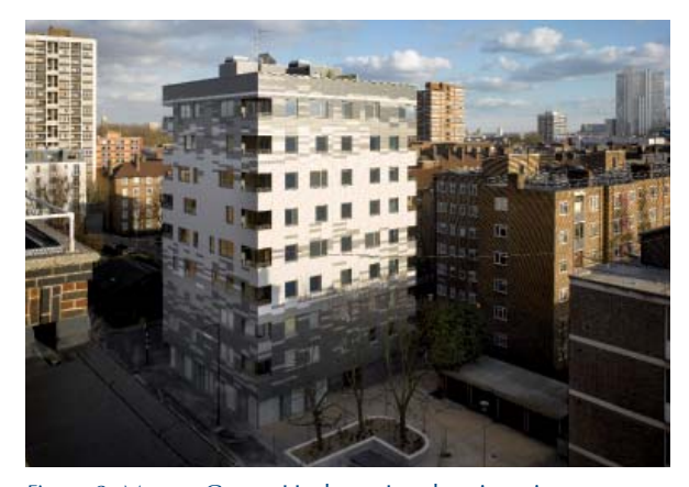
Figure 2: Murray Grove, Hackney, London, is a nine-storey block – CLT panels are used as loadbearing walls and floors