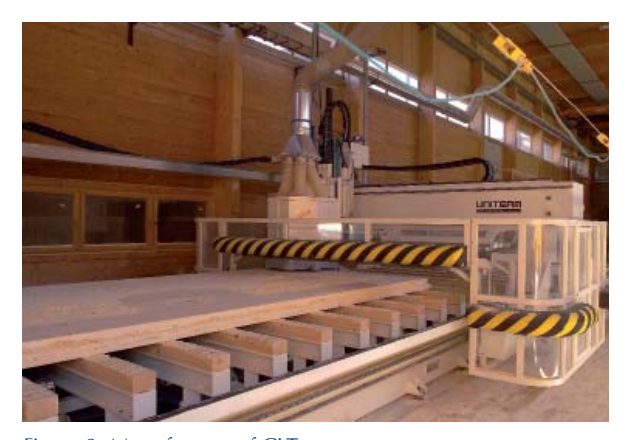
Figure 3: Manufacture of CLT