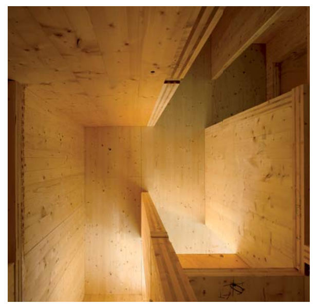
Figure 1: Cross-laminated timber can provide a finished surface as soon as it is installed – installation of future fixtures and fittings is relatively quick and easy

CLT normally forms the structural floor and wall element of buildings, and has been used successfully to build up to nine storeys in the UK (Figure 2). It is typically used in offsite manufactured panels delivered to site for erection via crane. As an engineered timber product, with the cross-grain movement controlled by the cross-lamination, it is broadly dimensionally stable and shrinks less than standard solid timber construction. While it is usable on small projects, it is more often used on larger schemes where offsite manufacture and speed of construction can reduce costs.