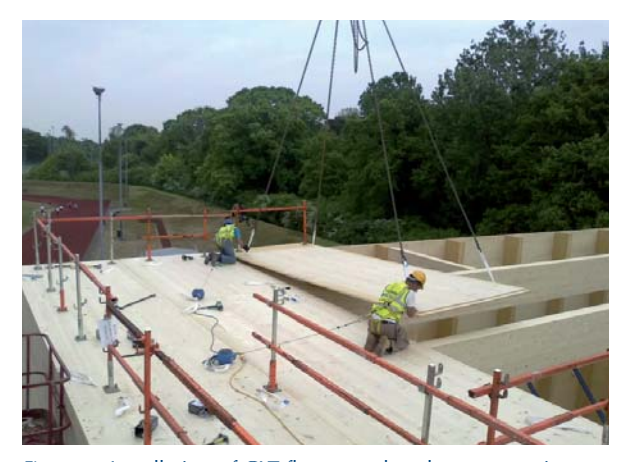
Figure 5: Installation of CLT floor panels - the construction environment is relatively free from noise and dust

Figure 4: Section detailing of an example cross-laminated timber construction – a flat roof would remove the thermal bridging issue at the roof join